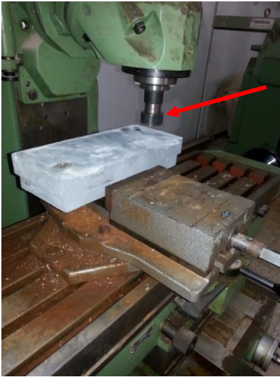
Tool mills two metal carbide Sizes

machining one notes that the tool crushes material it does not have their cut. In short: Even however the cutting speed and speed decreases by it in advance; this nuance of the matter of tool is not appropriate for the machining of concrete HPC where HPCF. With another test one takes the same tool with a speed of 40 tr/min the mini value on the machine, and even speed in advance one notes that stop them cutting changed color as of the first master key and the same stop them cutting are to damage, so takes some of other passes one notices that the tool will damage all stop them cuts because the material Concrete with machined east constitutes of sand of dune which contains silica grain which explains the hardness of this concrete and the black zone in figure 3.