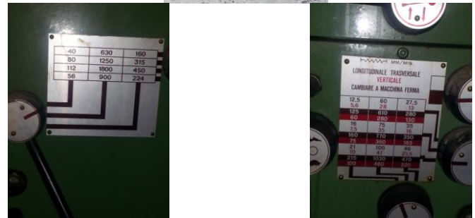
Figure 3: problem of machining and variation of the parameters of cuts

For the test of following surfacing one used a strawberry two Sizes diameter 80mm to brought back plate SANDVIK with a rotational frequency 630tr/min and advance a value of 125mm/min; during machining in the first does not pass from remark; for the second master key at the end of the operation of surfacing it appears a flame, this flame and due to the temperature due to friction tool part, one stopped the machine for bomb disposal expert the rotational frequency of 630tr/min to the value 315tr/min it there is always problem of machining, there thus one has to decrease speed until 160tr/min and the flame is disappeared.