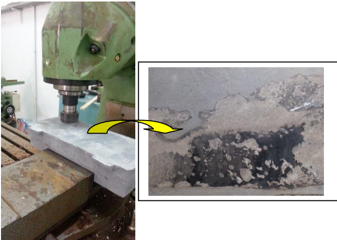
Figure 2: problem of machining

V_f = 770\text{mm/min} , as of the first master key appears a flame in a zone of the part as indicates it the following figure: