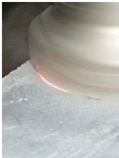
Figure 5: Before reducing speed.

For a test of surfacing on another concrete HPCF part one raised two points essential 1st it is that if one takes the same cutting speed with a depth of cut equal or lower than 1mm, one notes that there is no problem of machining but for the 2nd point if the depth of cut is increased one notices the appearance of a flame there one intervened for decrease the machine, to decrease the number of revolutions until 160tr/min, the following figures explains the phenomenon.