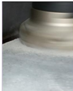
Figure 9: After the reduction speed.

The operation of surfacing on a Concrete part HPCF (Concrete fibre ultra high efficiency) with milling showed that machining without use of lubrication was one can difficult because the part is very hard, to maintain the form of stop cuts it is necessary to use lubrication; after use of the last one has vary the number of revolutions of 630tr/min until the speed of 160tr/min for the 1st speed one notices the light-back even with the use of lubrication as indicates the figure so below but the 2nd disappearance of the flame; thus even with the use of lubrication one notices the appearance of the flame. One can calculate the advance F of the formula: