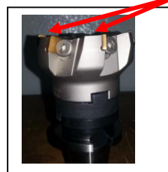
Plate b rought back

For the test of following surfacing one used a strawberry two Sizes diameter 80mm to brought back plate SANDVIK with a rotational frequency 630tr/min and advance a value of 125mm/min; during machining in the first does not pass from remark; for the second master key at the end of the operation of surfacing it appears a flame, this flame and due to the temperature due to friction tool part, one stopped the machine for bomb disposal expert the rotational frequency of 630tr/min to the value 315tr/min it there is always problem of machining, there thus one has to decrease speed until 160tr/min and the flame is disappeared.