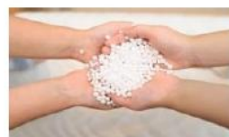
Fig. 1 Polystyrene granules, whose density is 35 kg / m 3

The cement used for the concrete was Ordinary Portland Cement, classified as 52.5 N CEM Class 1 according to BS EN 197-1. Polystyrene was used with a density of 35 kg / m 3 and (Fig. 1) shows the polystyrene used, natural sand with a specific gravity of 2.66 was used, SIKKA TEMPO 12 superplasticizer was used, and water was used according to the specifications of drinking water.