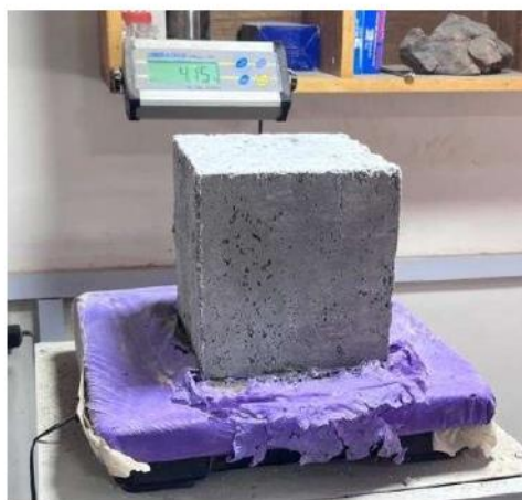
Fig. 3 The result of the weight of a cube size (15 * 15 * 15 cm)